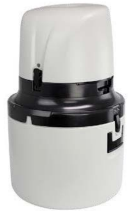
ProSample P and P-12