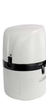
ProSample PM and PM-12